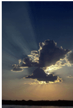
HOPE FOR TODAY

O—Open for anyone interested in Al-Anon.